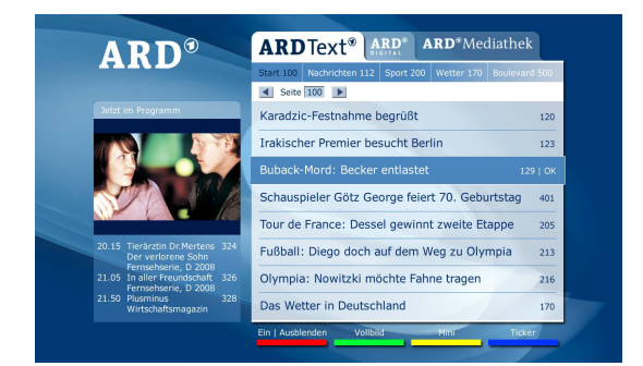
Figure 1: Mock-up of 2nd generation DTV text service

With the introduction of HDTV on the horizon, many players are planning to replace classic Teletext technology with more recent and flexible technologies. This will also allow for the introduction of improved subtitling services.