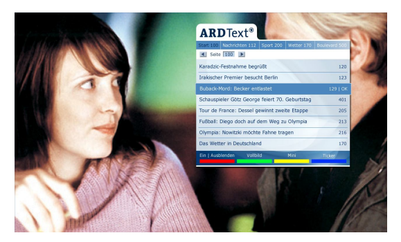
Figure 2: Mock-up of overlay in reduced-size format of sample DTV text service

The DTV4All project will study different technology streams in this context which mainly are: